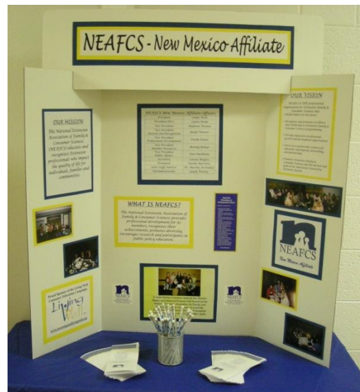
The New Mexico Affiliate of NEAFCS proudly displays informational materials at conferences, meetings and events to market the professional organization and members' accomplishments.