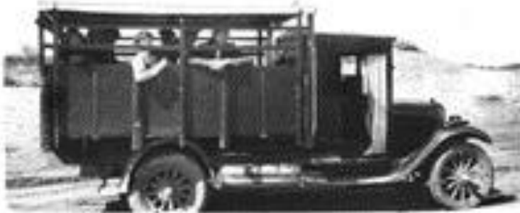
A truck full of 4-H'ers heads to Las Cruces for State 4-H Club Encampment, Circa 1930.

Although Extension work had grown in popularity in New Mexico, emergency appropriations that funded expansion of Extension staffs during World War I were phased out and staffs had to be trimmed. In 1923, policy dictated that each county have only two professionals, a male county agent to work with the men and boys and a female home demonstration agent to work with women and girls. 4-H activities and events continued, although the organization did not grow in membership the way it had in the first decade.